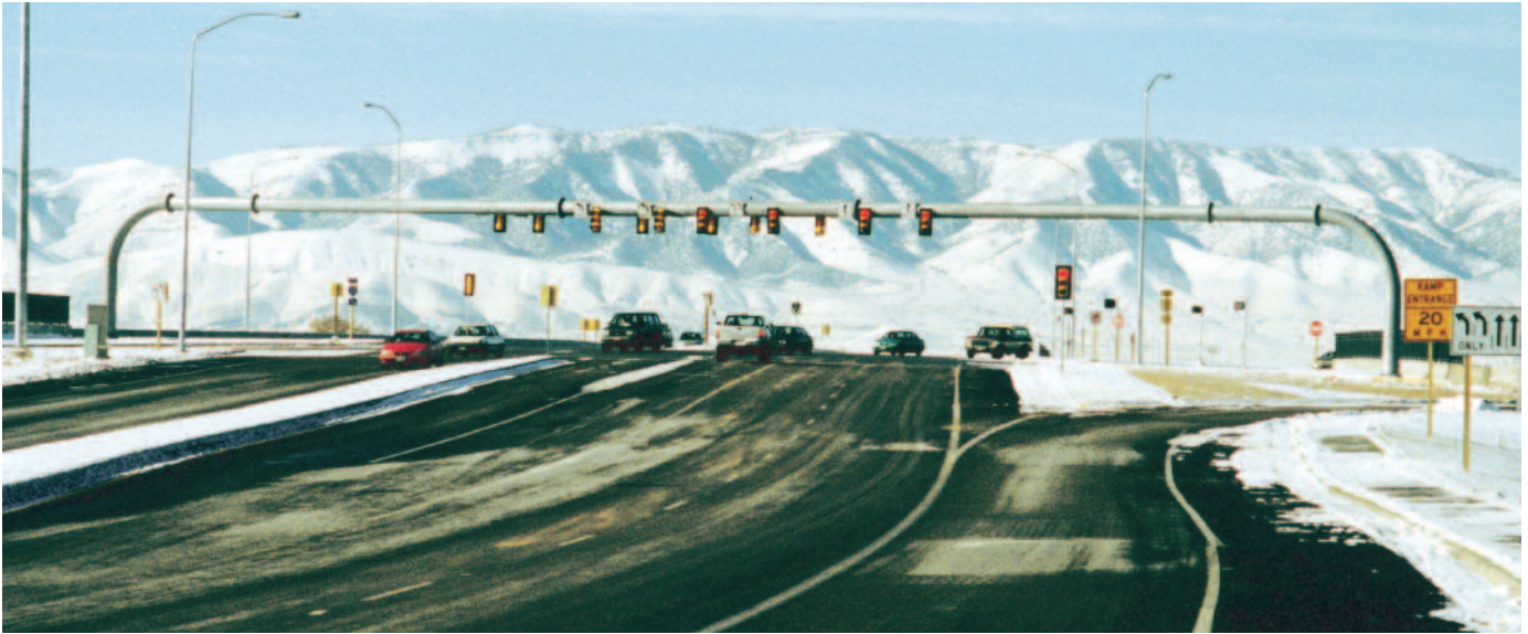
Large span signal structure